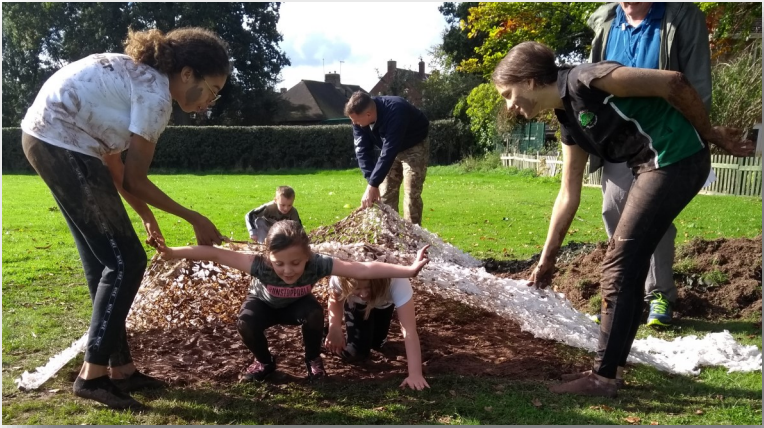
In the thick of it! (muddy cargo net at the mud run)