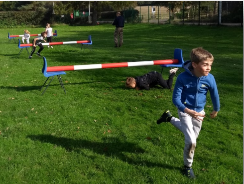
Tackling the water slides at the mud run (left)and the steeple chase!! (right)

Training for our 6 schools took part over 2 sessions this year with St Marys and Shifnal leader teams being trained together at St Marys and the rest visiting Idsall to be trained together. As always the aim of the session was to develop understanding of what each role involves and how they can contribute to their schools by developing skills and ideas that they can use to increase participation of activity during lunchtime and afterschool clubs. Bronze Ambassadors were trained up to lead level 1 competitions and personal challenges. So far Beckbury have lead a cross country competition for their school, I am looking forward to seeing what the other schools are getting up to and which leadership team wins the family leadership award this year!