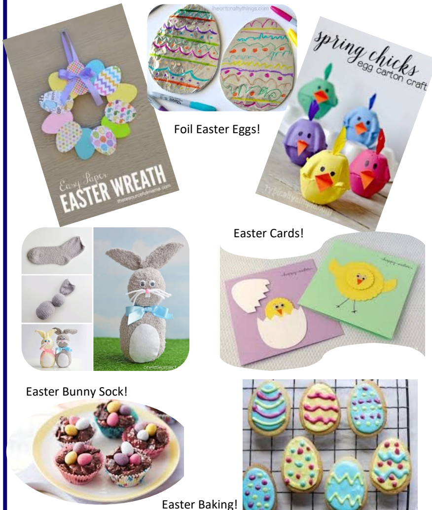
Foil Easter Eggs!

We have included some Easter craft ideas which you might enjoy!