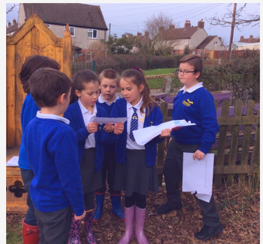
WE ARE SO PROUD OF THE WAY THEY HAVE SETTLED BACK IN TO SCHOOL.