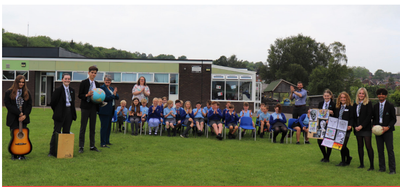
Oldbury Wells and Castlefields students.