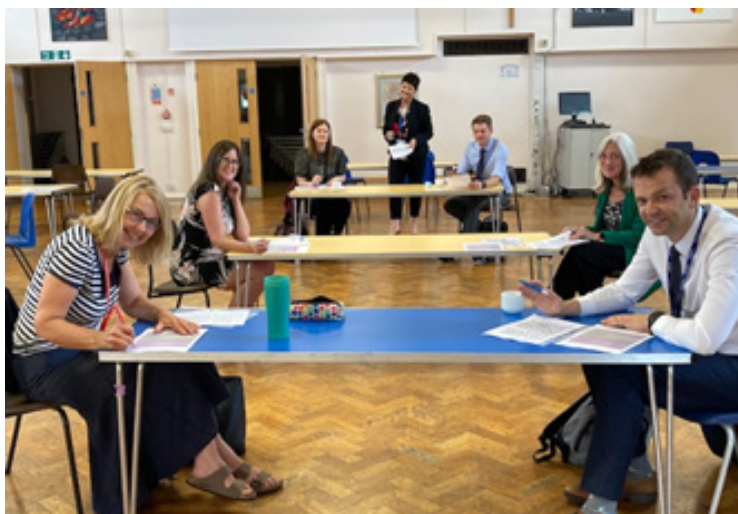
Some of the participating teachers.

Teachers across the area of Bridgnorth have worked together this term to share writing examples from their Year 6 pupils. This was part of a range of joint activities local teachers have been involved in.