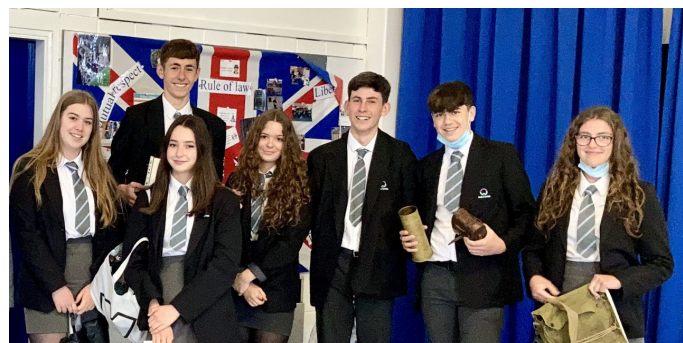
Subject Ambassadors for D&T, Science and History at Stokesay School.