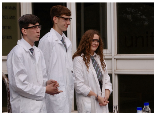
A Science experiment for pupils at Alveley.

Some of our secondary pupils have been selected as Subject Ambassadors. They were picked by their teachers for being outstanding role models and for having excellent knowledge and skills in particular subject areas. The Ambassadors from Church Stretton School and Oldbury Wells School have been sharing information with primary schools. Primary subject leaders thought it would be good if they knew more about how subjects progressed into courses at secondary. Our Subject Ambassadors rose to the challenge, and they wrote to Primary Teachers to explain it from their student perspective. The other main activity the Ambassadors have undertaken is to lead a series of assemblies in primary schools. In the last two weeks, all of our primary schools have had outdoor / distanced assemblies led by secondary pupils.