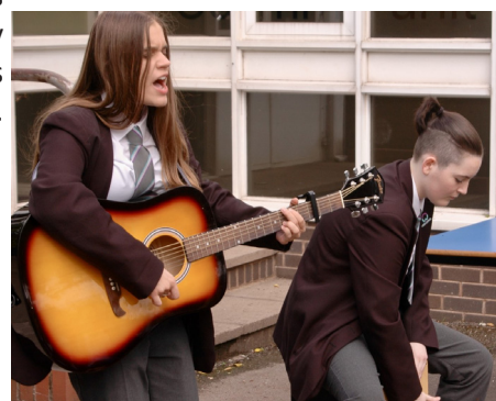
Music performance in outdoor assembly at Alveley.